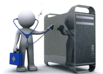
Daily Tech Support